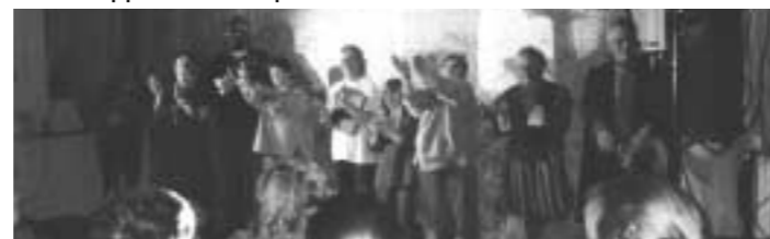
The Monks Path Theatre was a Rural Creative Project supported by The Calouste Gulbenkian Foundation.