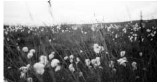
Cotton Grass, Holne Moor. Summer 2001

While AHA's activities were all but on hold from February through June, there is a surprising amount of information to report. We hope there is something of interest for everyone in this issue.