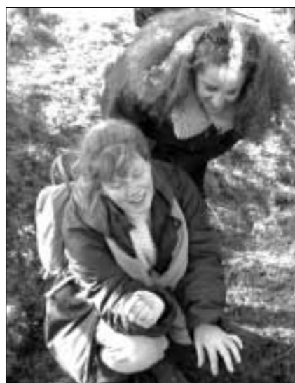
Listening Walk, February 2001