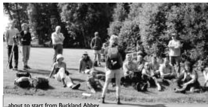
...about to start from Buckland Abbey

Please clip this form and send it, together with a cheque payable to Aune Head Arts, to: Aune Head Arts, c/o Court Gate Cottage, Harbournford, South Brent, Devon TQ10 9DT