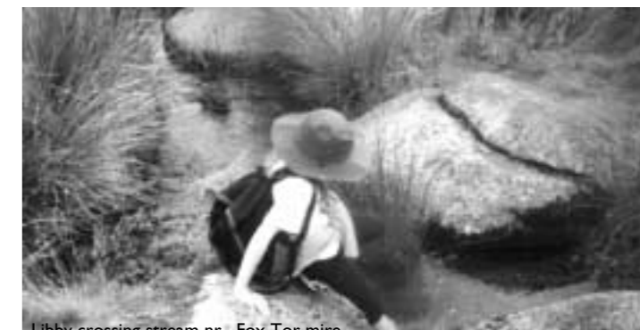
Libby crossing stream nr. Fox Tor mire