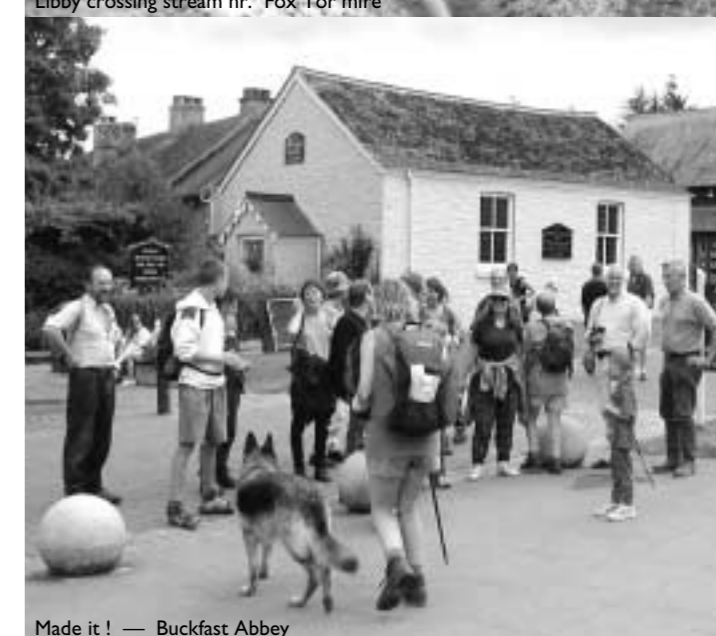
Made it! — Buckfast Abbey