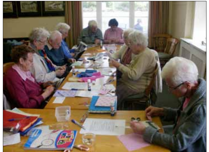
The Soundings group getting stuck in.