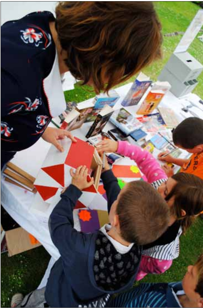
The Lovely Lady and customers.