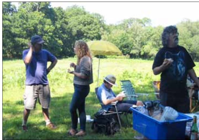
Kill It • Chill It • Grill It, AHA's picnic

— it was a great evening. Now there is a chance to join AHA for lunch and a chat on the First Friday of every month (excepting January and August). The only requirement of participants is that they bring a bit of food to share and be prepared to join in the conversation. It's been great hearing about people's work in progress, their new ideas, recent experiences (art related or not...) and what currently inspires them. People from differing disciplines have shared their ways of looking and making and provided each other with valuable information signposting, networking opportunities, etc. And the food has been brilliant! Home baked pizza, lovely salads, dips made of home-grown and