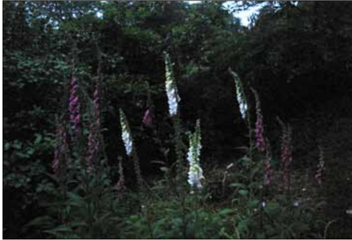
White foxgloves glowed in the dark.

In the formal gardens Tony drew our attention to what was the last birdsong we heard that evening -- a blackbird bidding us