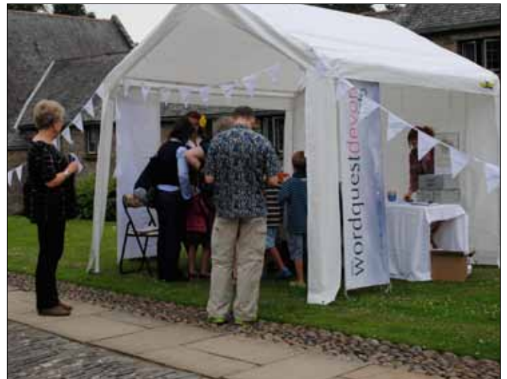
Tombola at WWW July 2011.

The generously donated prizes included vouchers, signed books by local authors and beautifully crafted wordcentric objects. Drawing a task slip meant the participant was encouraged to take on one of the word-themed challenges devised and donated by Devon writers and word artists. The tasks invited participants to take their imagination for a stroll around Dartington, stretching some creative muscles, and to come back with a written response. Paula's pitch proved irresistible and people happily shared their snippets of memories, gems of knowledge and intriguing tales about Devon. A number of generous souls read their prose and poems to camera -- Paula turned those readings and writings into a lovely, thought-provoking and inspirational eleven minute