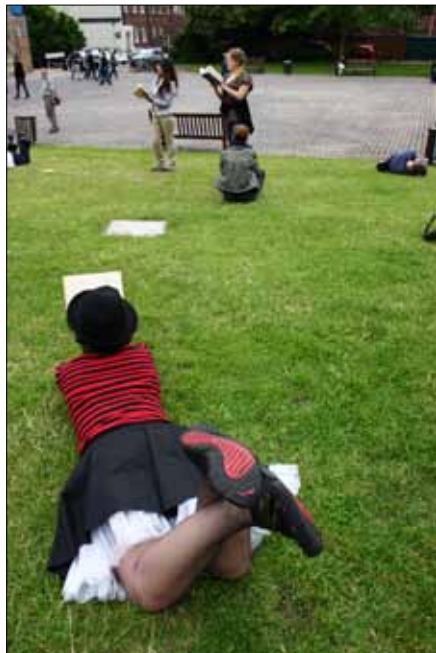
Flash Mob performers.

The Launch: Charlie's first challenge to the public was to put on their dancing shoes and come prepared to do some synchronized and syncopated dancing with books at the official launch of Wordquest Devon